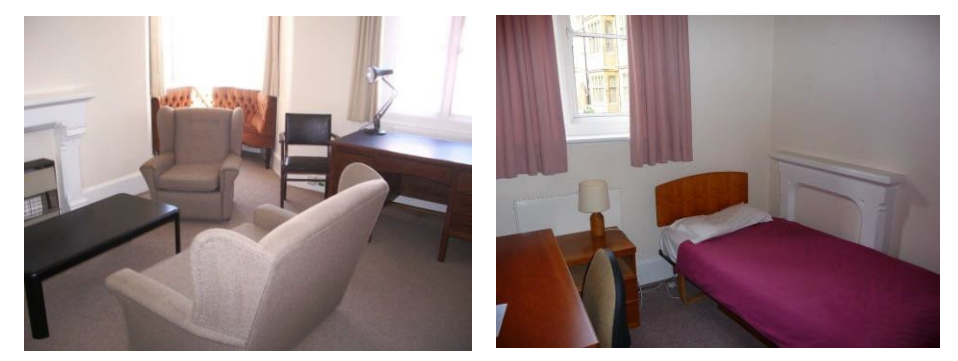
Whewell's Court sets are pleasant spaces to live arranged around a small central lawn.