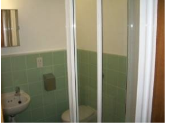
A typical Wolfson en suite room.

The Wolfson Building is a dedicated fresher accommodation area, with single rooms in a modern building within Blue Boar Court, Most rooms here are en suite bedsits, however there are some cheaper non-en suite rooms available.