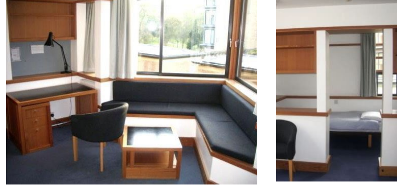
A modern single set in a tower staircase (H-U).