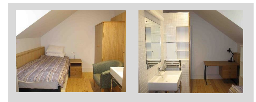
A small bedsit in B New Court