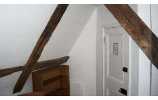
Rooms in Nevile's Court tend to be full of character, with interesting architectural features.