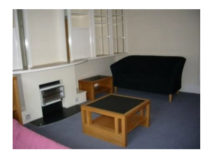
A Blue Boar bedsit, with a sink in the room but shared bathroom facilities with the rest of the staircase.