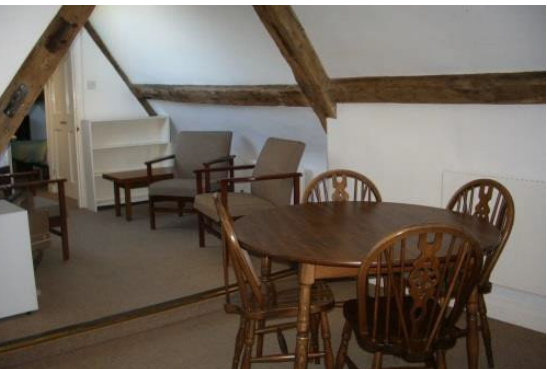
A roomy single set in Nevile's Court, with sloping ceilings and exposed wooden beams.