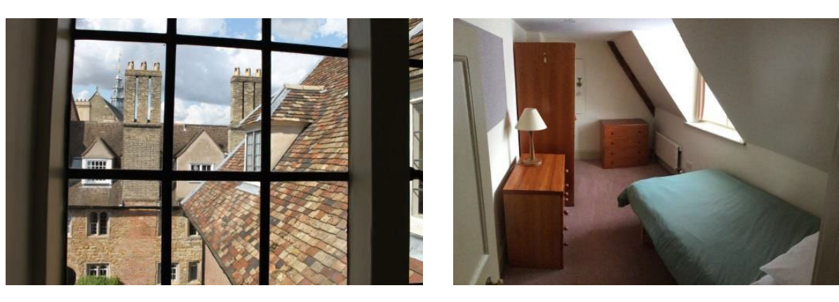
An attic set in 'A' Bishop's Hostel. This bedroom is adjacent to a spacious living room.