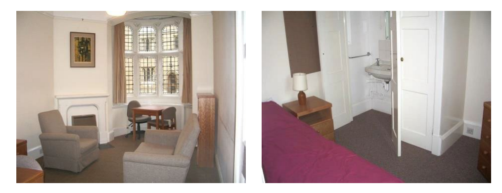
All Whewell's Court rooms have shared bathroom facilities but the bedrooms are equipped with a washbasin.

The shared bathroom facilities are situated in the basement below the courts, and there is also a laundry here. A select number of Whewell's Court rooms have their own personal mini-gyp rooms with a fridge, sink and food preparation area. Space-dependent, there will be a microwave and/or toaster in these rooms as well.