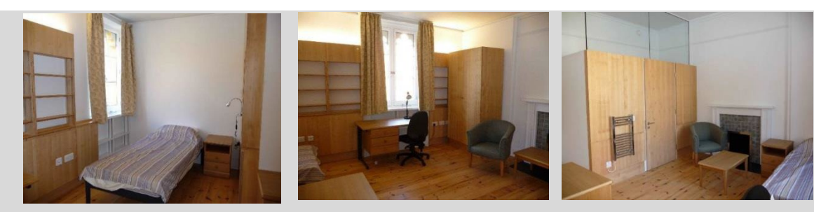
A large en suite bedsit in 'F' New Court. All rooms in New Court have underfloor heating and a sink in the room.